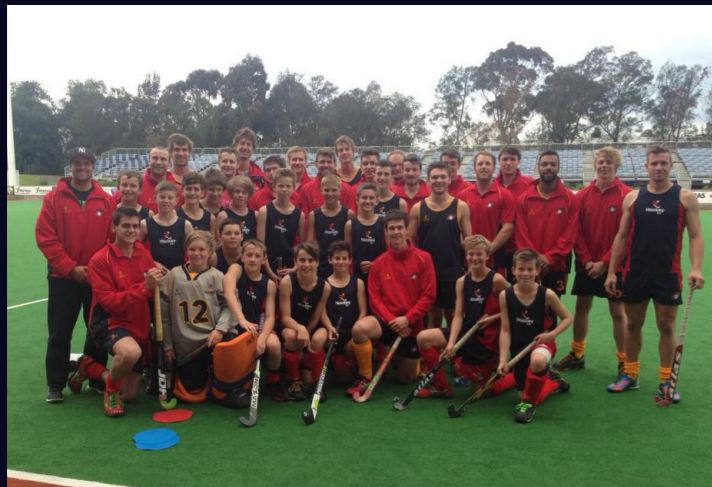
AHL Southern Hotshots & Under 13 boys