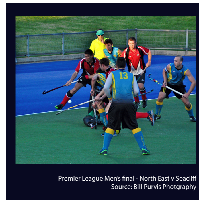
Premier League Men's final - North East v Seacliff