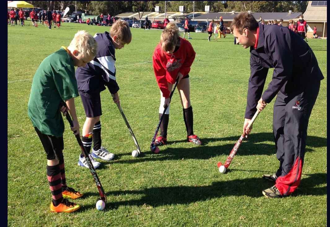
North East SAPSASA Clinic