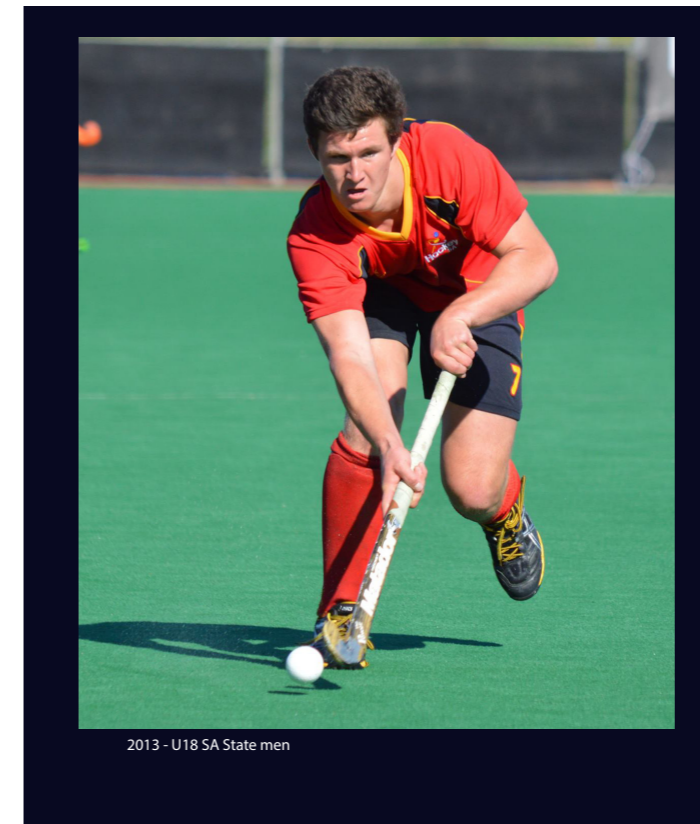
2013 - U18 SA State men

The Association successfully hosted a range of national tournaments during the past twelve months including under 21 women, under 15 men, national primary schools and the university games.