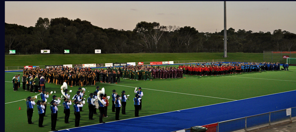
Opening Ceremony

Ten years since Adelaide previously hosted the Australian Women’s Masters Championships in 2003, the championships returned to the State Hockey Centre on September 26th, 2013 shortly after the official opening of the new ‘second pitch’.