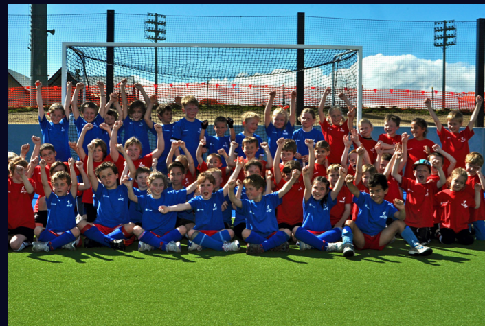
Under 9 boys and girls

The day concluded with Premier League women’s and men’s finals on pitch one.