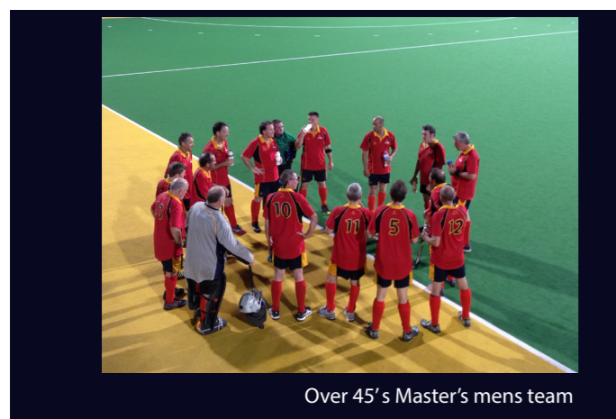
Over 45's Master's mens team