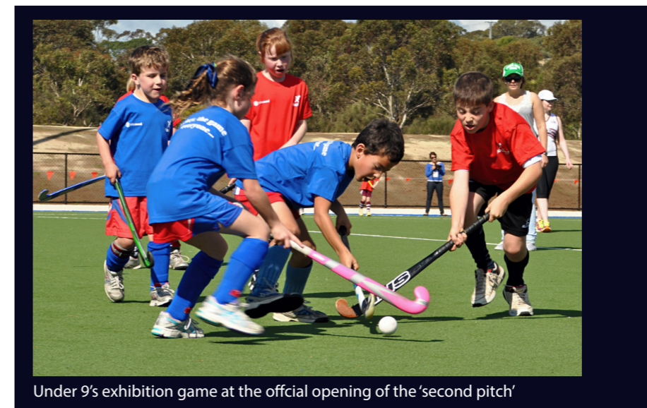
Under 9's exhibition game at the official opening of the 'second pitch'