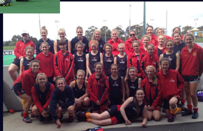
AHL Southern Suns & Under 13 girls